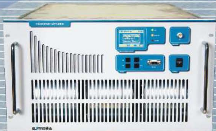
▲ Amplifier front panel